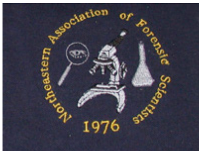
Simple Embroidered NEAFS Logo Choice Logo comes in Black with Grey or Yellow with Grey